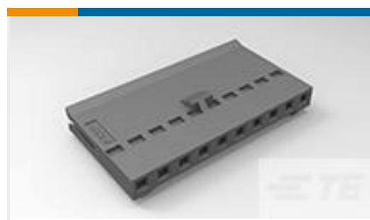
TE Part # 1-487769-8 020 HOUSING FFC RCPT 100CL SR